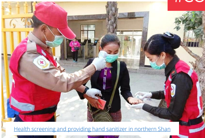
Health screening and providing hand sanitizer in northern Shan