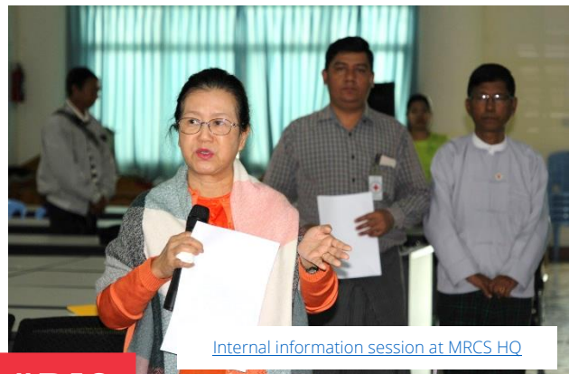
Internal information session at MRCS HQ