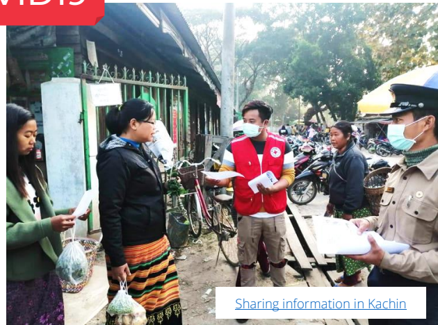
Sharing information in Kachin

Myanmar Red Cross Society (MRCS) has been in close coordination with the Ministry of Health and Sports (MoHS) at national, regional, and township levels and has mobilized a large number of Red Cross Volunteers (RCVs) and staff to support the MoHS responses in awareness raising, health education, screening of migrant people and community-based surveillance activities. MRCS launched procurement personal protective equipment (PPE), sanitizers, and masks and distributed information materials in communities and through social media. MRCS continues to lead the Red Cross & Red Crescent Movement (the Movement) Task Force which convenes twice a week to effectively and timely respond to the fast-evolving situation and to show solidarity as the Movement partners in Myanmar. To see more activities, please visit here .