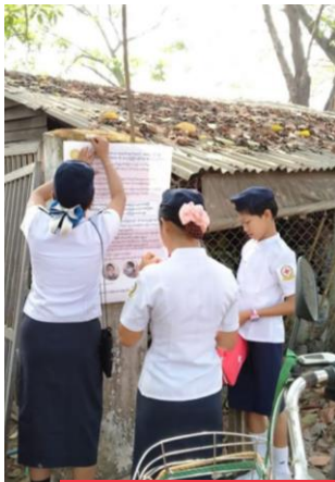
Distributing posters in Yangon