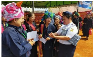
Sharing preventive tips in Shan state