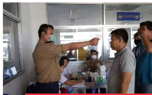
Health screening in Kavin state