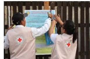
Poster distribution in Sagaing Region