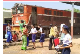
Info sharing in Mon state