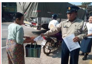
Info sharing in Ayayarwady Region