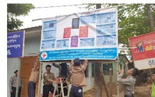
Billboard set up in Kayin state

Latest statistics from the Ministry of Health and Sports (MoHS) as of 8pm, 16 March 2020