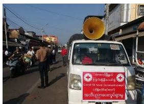
Outreach in Tanintharyi Region