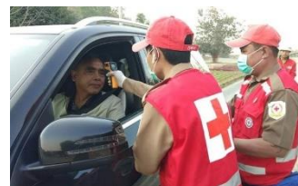
Health screening in northern Shan state