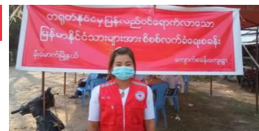
The backdrop says "checkpoint for returnees from China"

Nowadays, I also go to quarantine facilities to provide psychosocial support. Most of the people in the facility rely on their family for food. I hope there were more food and water for them. People here are more worried about loss of income than COVID-19 itself. I am very proud and happy to help people when they need assistance. My only wish is to have more gloves, masks, and face shields for myself and other RCVs. With proper protection, we will be able to help better and safer.