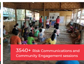
3540+ Risk Communications and Community Engagement sessions