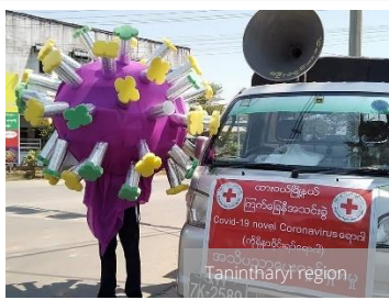
Risk Comm. & Community Engagement