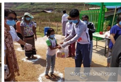
Increased access to basic needs