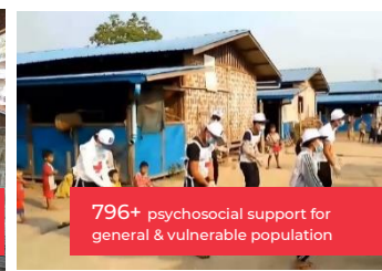
796+ psychosocial support for general & vulnerable population

7 fundamental principles guiding MRCS's work on COVID-19 and all times