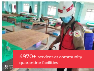
4970+ services at community quarantine facilities

Facts and figures of MRCS COVID-19 response recorded as of 13 April 2020 (source: MRCS )