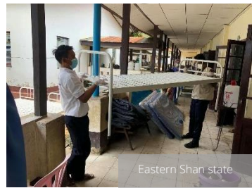
Eastern Shan state