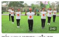
GoAwayCorona a week ago · 396.8K Views 35K