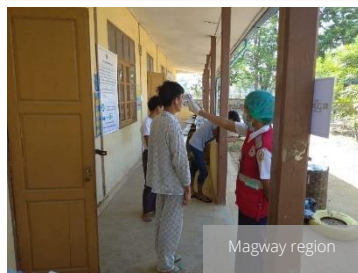
Services in support of government