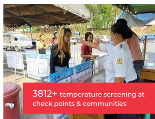
3812+ temperature screening at check points & communities