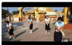
GoAwayCorona a week ago · 479.9K Views 35K