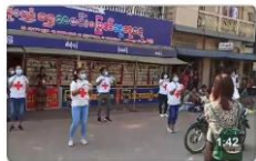
GoAwayCorona a week ago · 457.6K Views 55K

MRCSS's "Go Away Corona Challenge" aiming to provide psychosocial support to both general & vulnerable population and remind people of preventive measures such as hand washing and coughing on elbows, attracted more than 1.3 million views and over 20,000 shares on social media. Watch here .