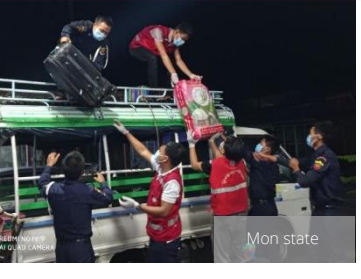
Services in support of government