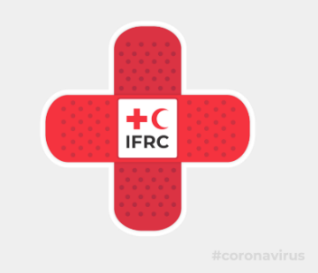
It is never late to be a trained first aider. Add yourself in our first aider's list.