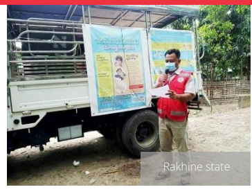
Risk Comm. & Community Engagement