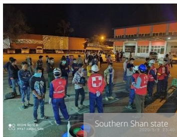
Southern Shan state

11,209+ activities in 291 townships organizing physically distancing awareness raising sessions and disseminating preventive information