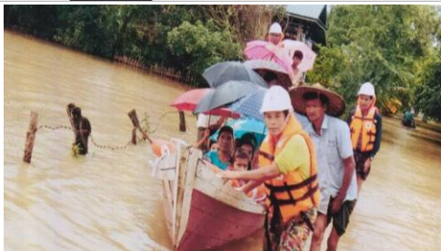
Minbya, Aug 2019: MRCS activities strengthened community-level actions to prepare for & respond to disasters in Rakhine.

Source: Surveillance Dashboard . Global figures here .