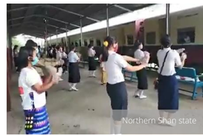
Northern Shan state