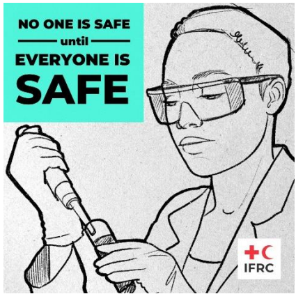
Why do we need 'People's vaccine' against COVID-19? Find out here.