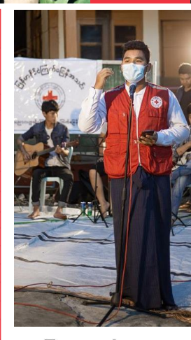
Everywhere for everyone.