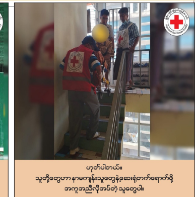
ဟုတ်ပါတယ်။ သူတို့တွေဟာ နားကျနဲ့ သူတွေနဲ့ဆေးရုံတက်ရောက်ဖို့ အကူအညီလိုအပ်တဲ့ သူတွေပါ။