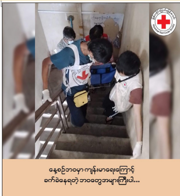
နေ့စဉ်ဘဝမှာ ကျန်းမာရေးကြောင့် ဝက်ခဲနေရတဲ့ ဘဝတွေအများကြီးပါ။...