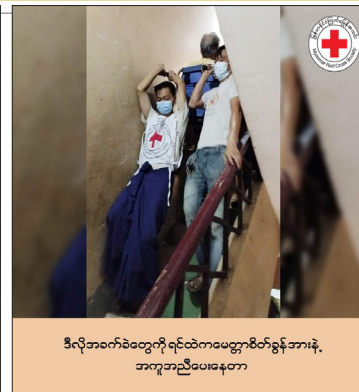
ဒီလိုအခက်ခဲတွေကို ရင်ဆင်ကပစ္စည်းကိစ္စနဲ့အားနဲ့ အကူအညီပေးနေတာ