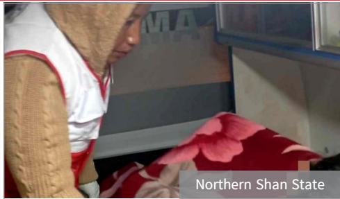
Northern Shan State

A patient in labor was transported from her house to Lashio Public Hospital in Lashio Red Cross Branch Ambulance on 10th January.