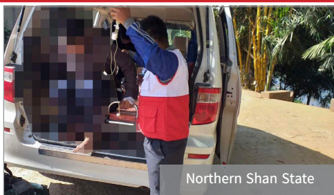
Northern Shan State

Activity to strengthen village houses to prevent against heavy wind