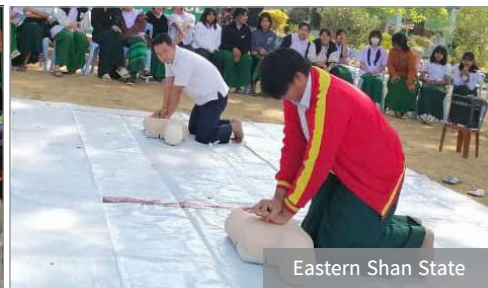
Eastern Shan State

Basic first aid training (1/2024) was organized in Sagaing Education Degree College to provide (198) students with both theory and practical means of BFA on 3rd January.